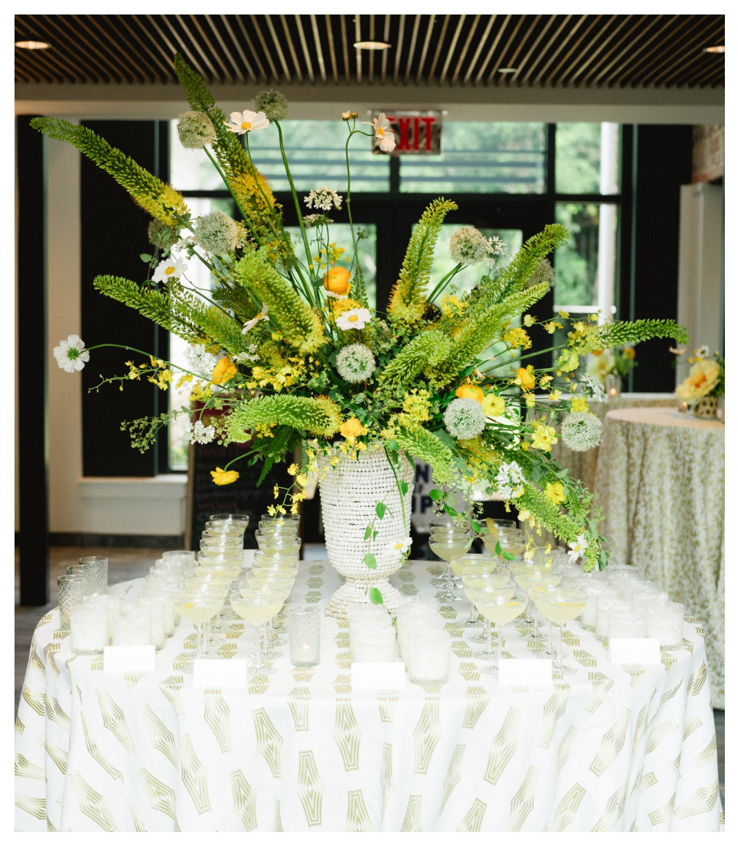
Welcome to the Historic Gin House!

Newly restored in 2023 this fresh take on history provides any event a timeless backdrop. With views over looking our award winning gardens the Gin House is perfectly perched in the center of the action of Boone Hall. Ideal for a, bridal shower, luncheon, or rehearsal dinner The Gin House is perfect for a party of 80 with sit down dining and up to 100 for a standing cocktail occasion.